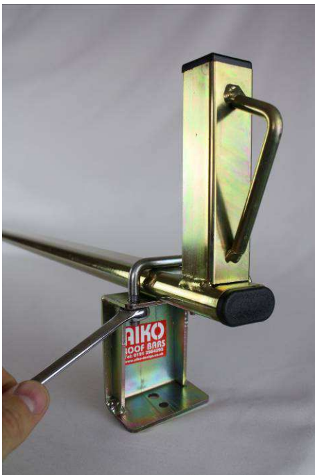
LS U-bolt fixing

Make sure that everything is secure and don't forget to give your rack periodic spanner-checks over the next week or so just in case it needs any settling down on the roof and that's it; we suggest a cup of tea at this stage.