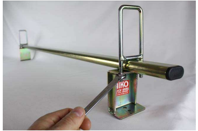
CS A-bolt fixing