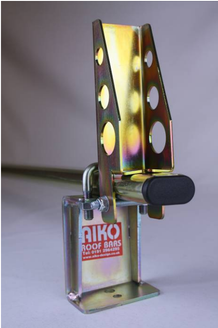
LS U-bolt fixing