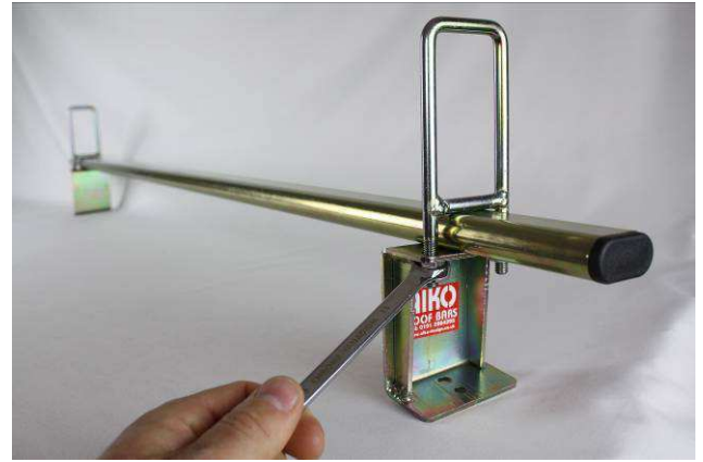
CS A-bolt fixing