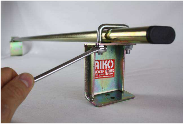
ZS U-bolt fixing