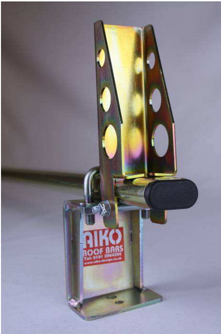
LS U-bolt fixing